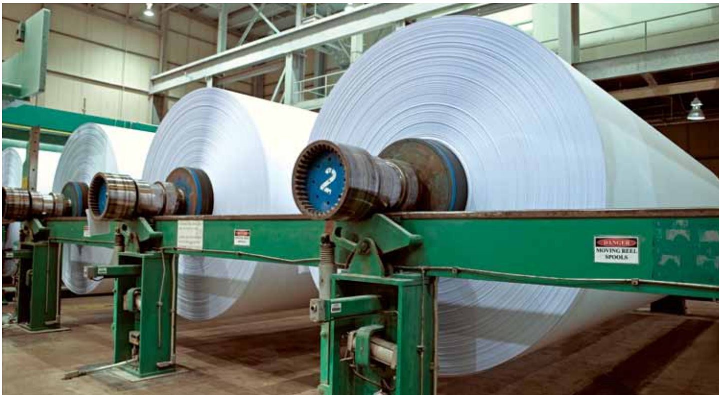
Domtar's Marlboro Mill has an annual paper production capacity of up to 389,000 tons.

where the motors were being built. Again, he says, the level of support he received from the plant was greatly appreciated.