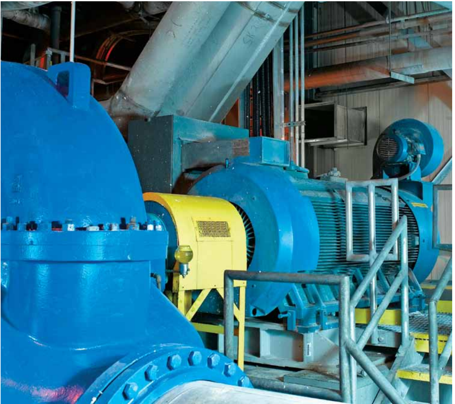
This first Baldor•Reliance motor installed was this 1,500 HP variable speed, totally enclosed, blower-cooled AC unit on the paper machine fan pump. The pump, located in the basement just below the paper machine, provides the stock flow used to put the fiber on the machine.

"We had a preference for the bearing lubrication design of the Baldor•Reliance® large AC motors,"